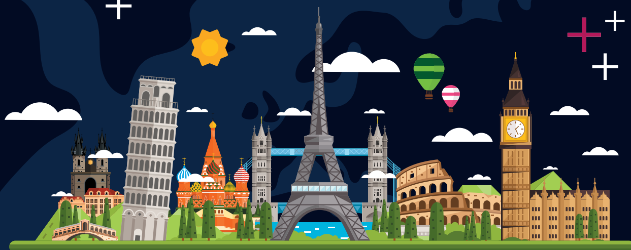
TABLE OF CONTENTS / TABLE DES MATIÈRES